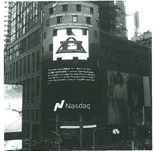
Powerful Messaging: BellTel News Towers Above N.Y. City's Times Square.

Without BellTel's ongoing protection and advocacy on behalf of all retirees, things likely would be a lot worse off for the Verizon retiree community. We appreciate the support of all our members and urge more to be a part of our unity, strength and continuing success.